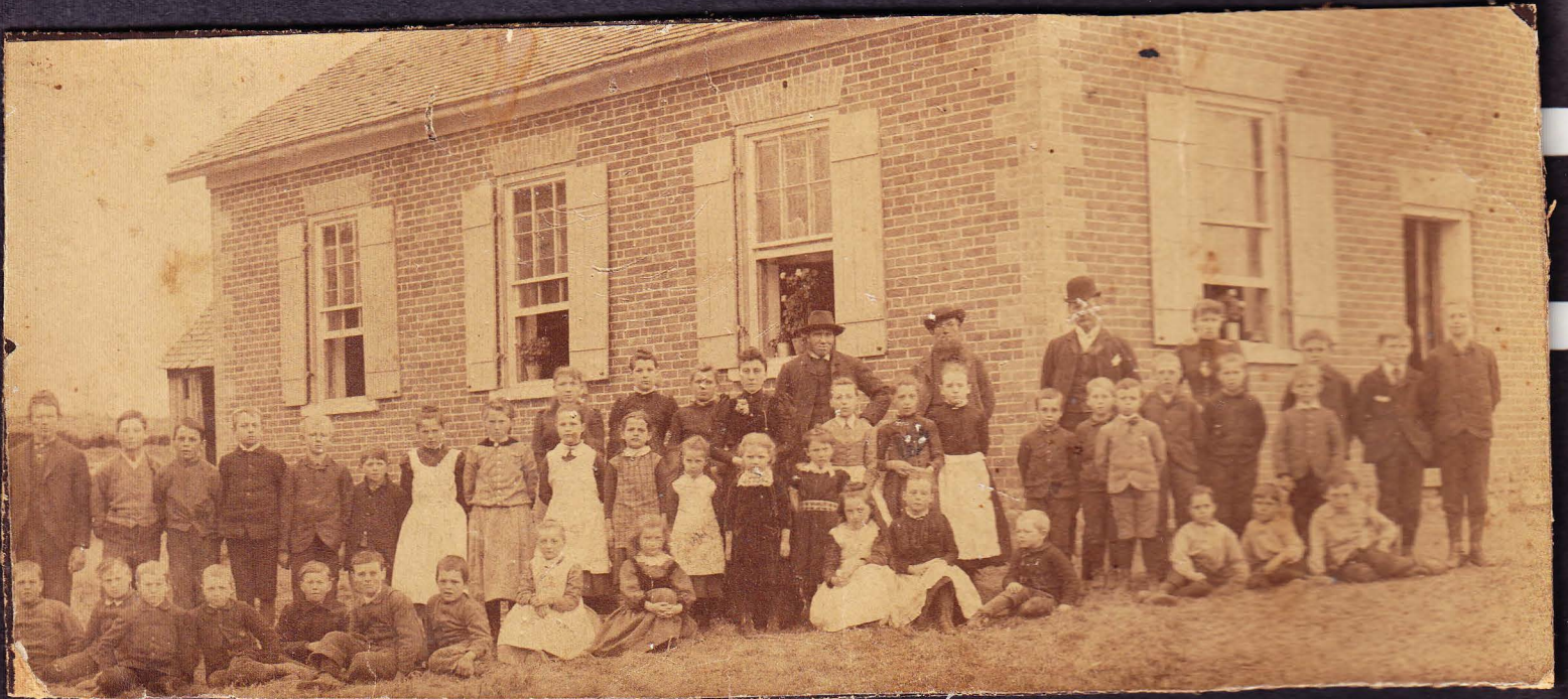
A very early photograph of a group at Blue Church School. It was the custom for parents and neighbours to be included when a photographer visited the school.