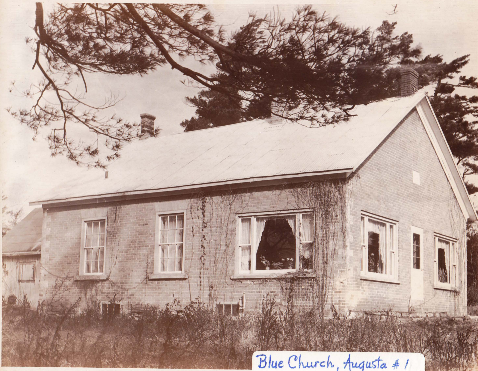
Blue Church, Augusta # 1