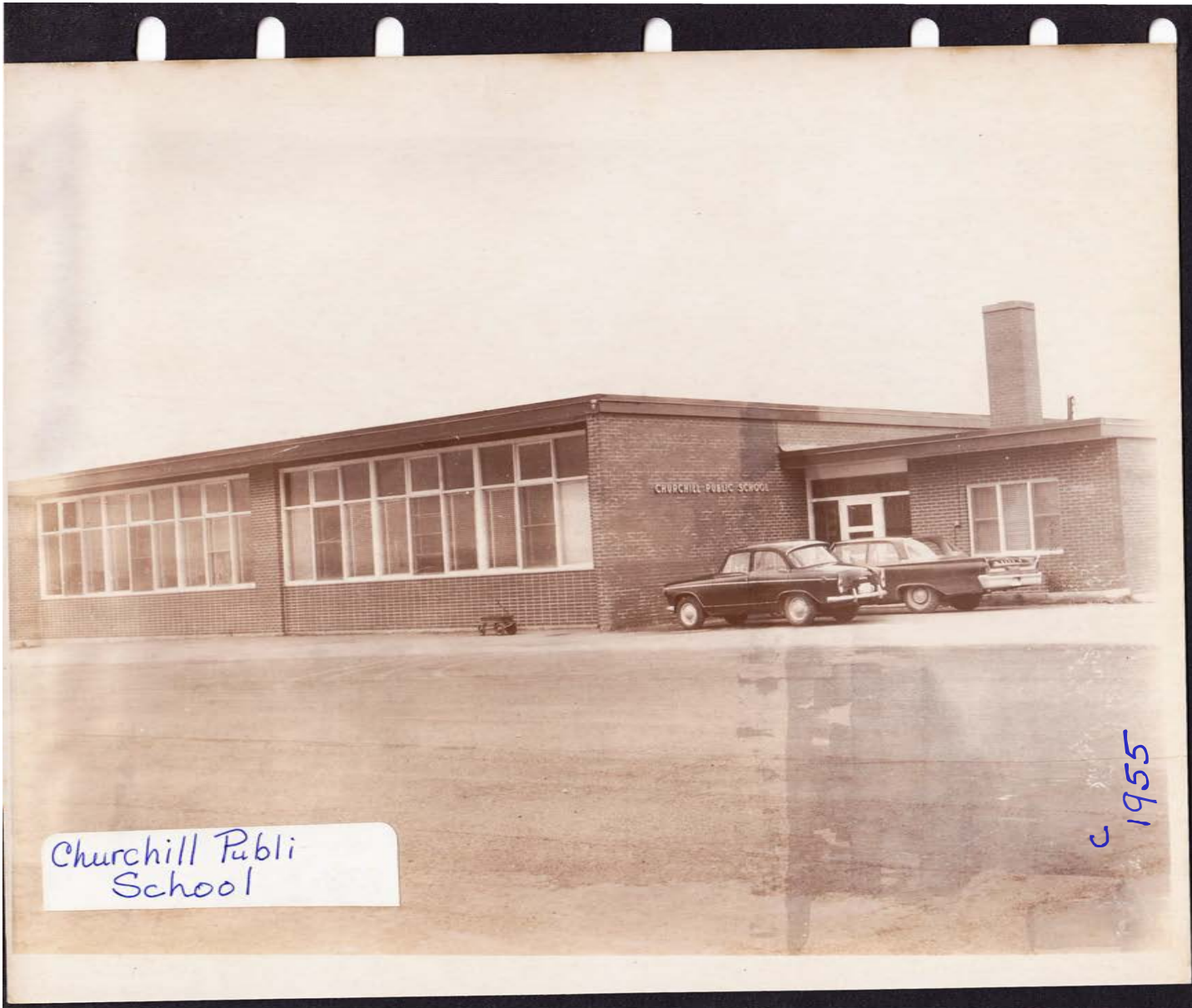
Churchill Public School