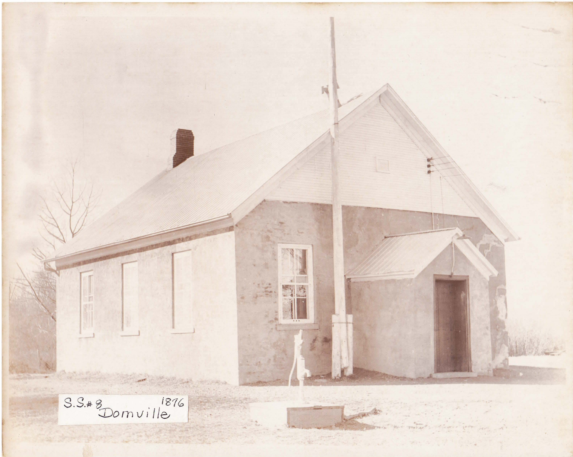
S.S.# 8 1876 Domville