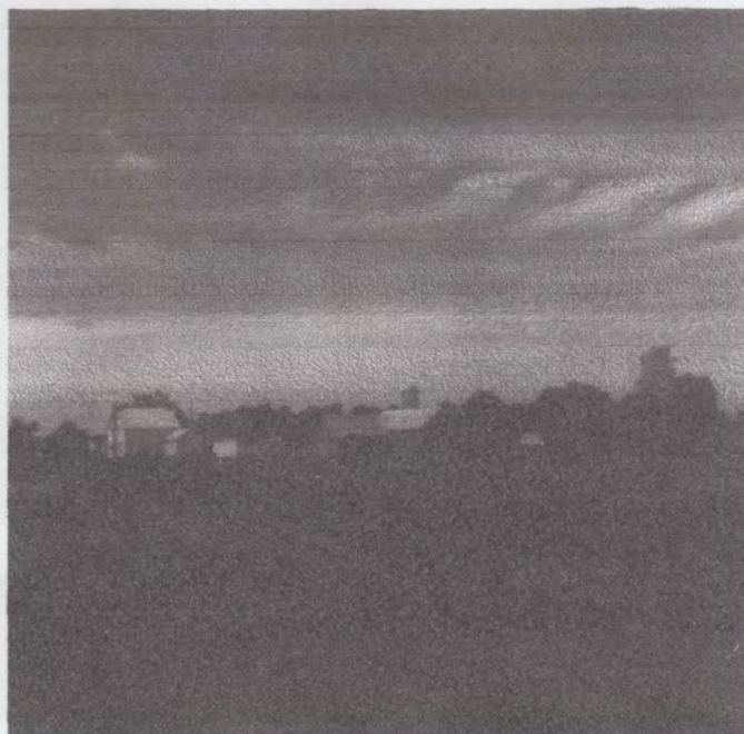
A VIEW FROM THE TRAINING TRACK