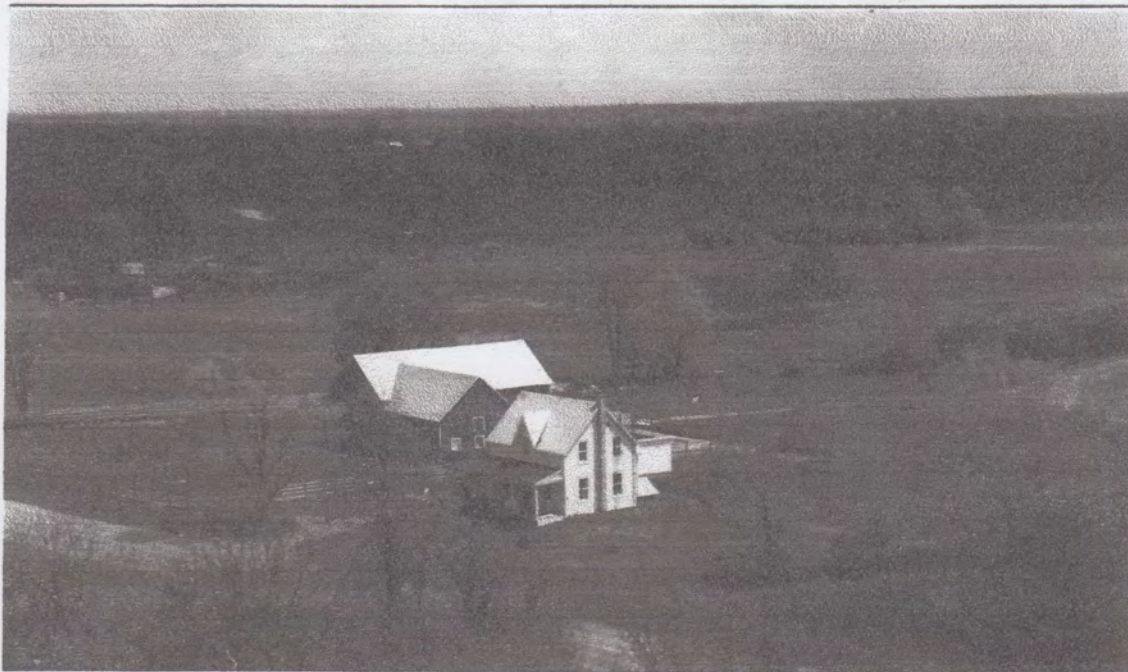
CENTER COMMONS "B" BETWEEN LOTS 18+19 SPRING 1984