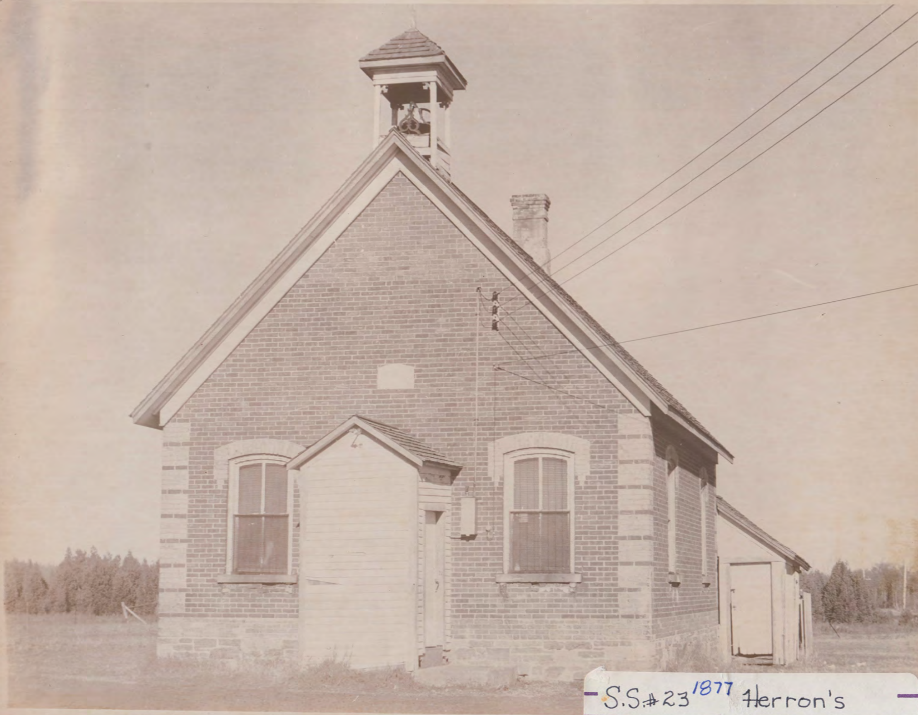
S.S.#23 1877 Herron's