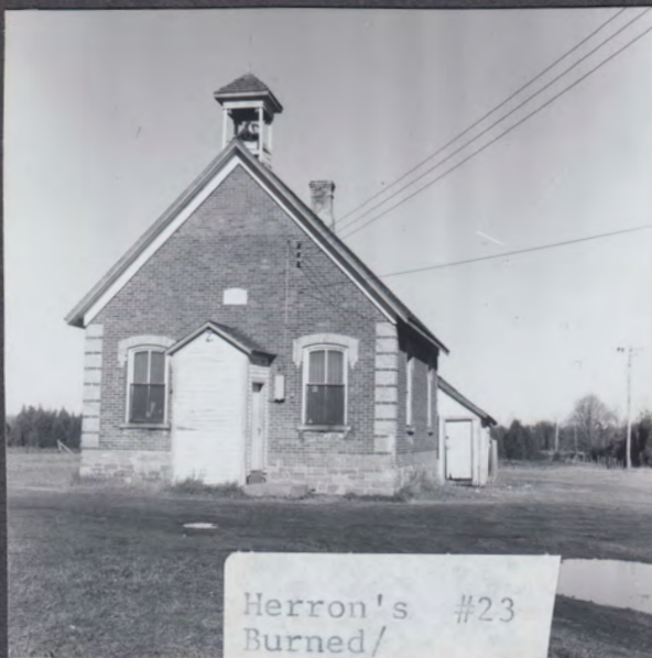
Herron's #23 Burned/