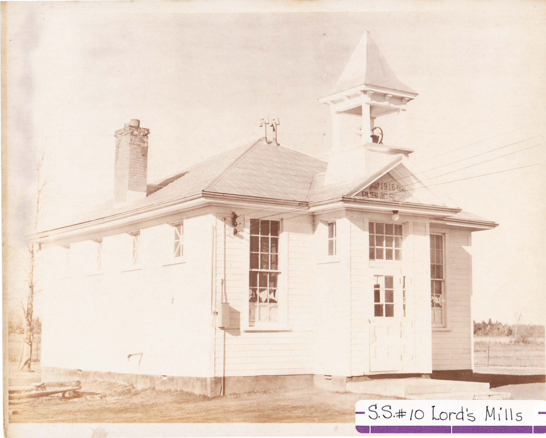
- S.S.#10 Lord's Mills -