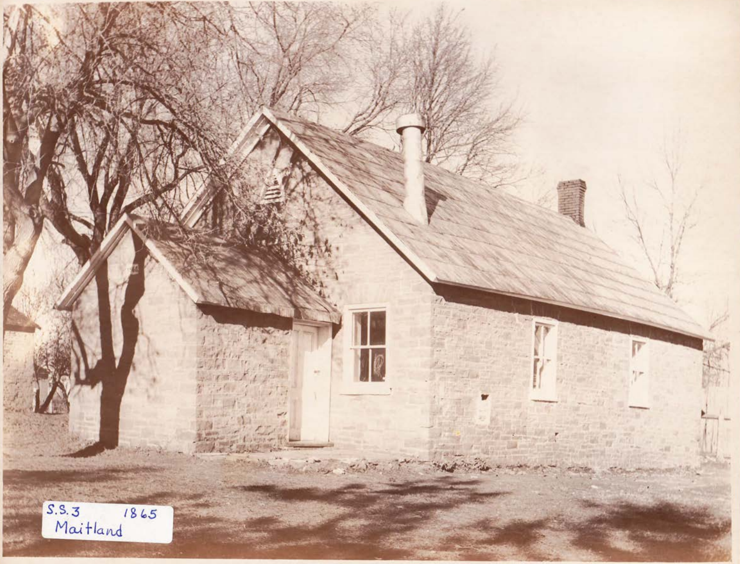
S.S.3 1865 Maitland