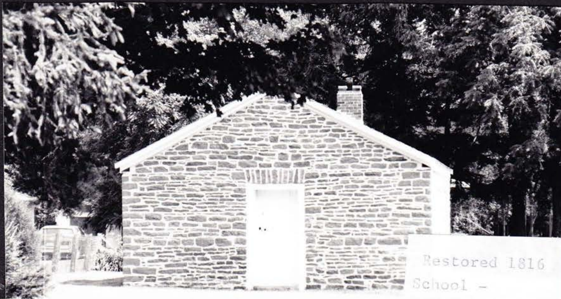
Restored 1816 School -