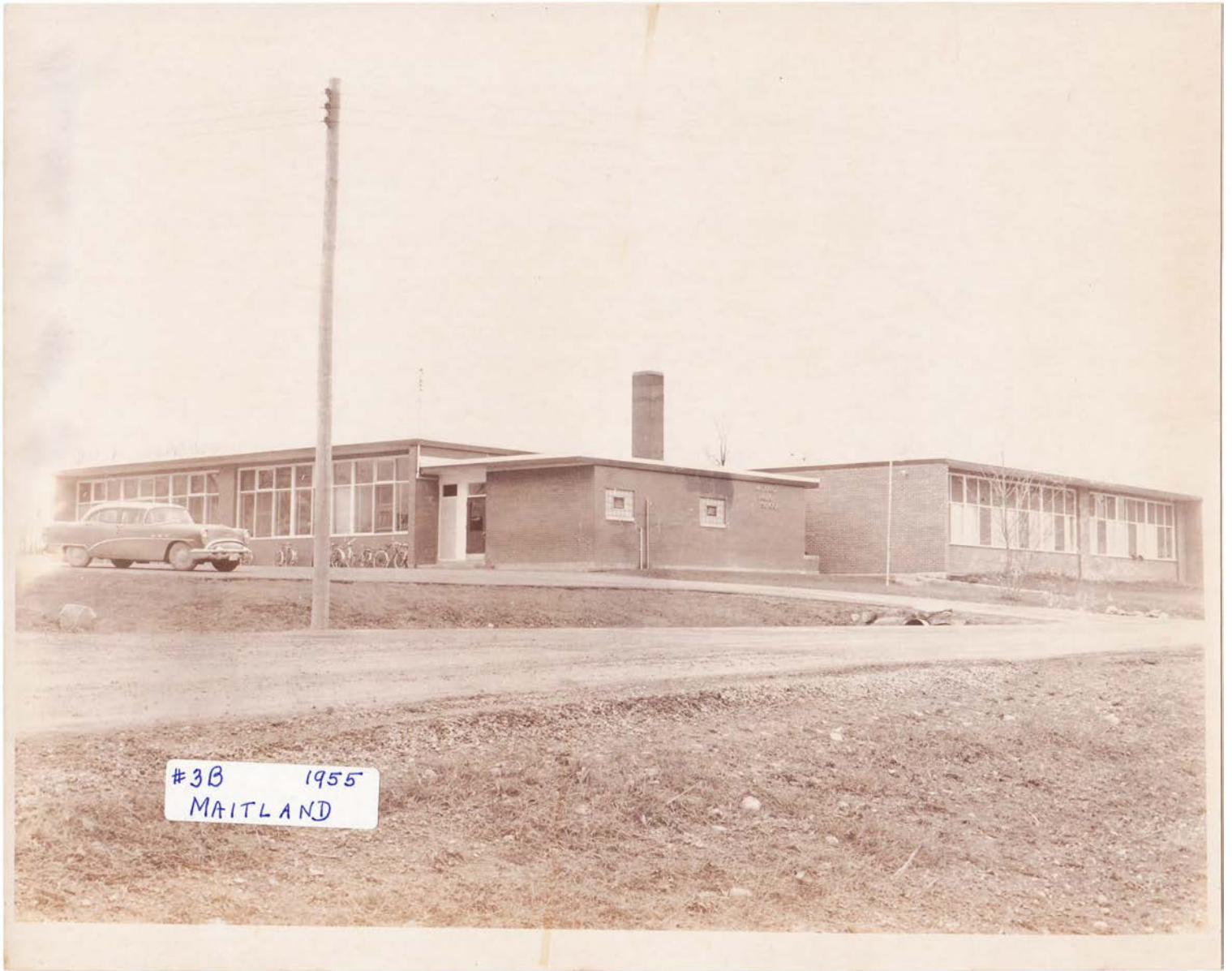
#3B 1955 MAITLAND