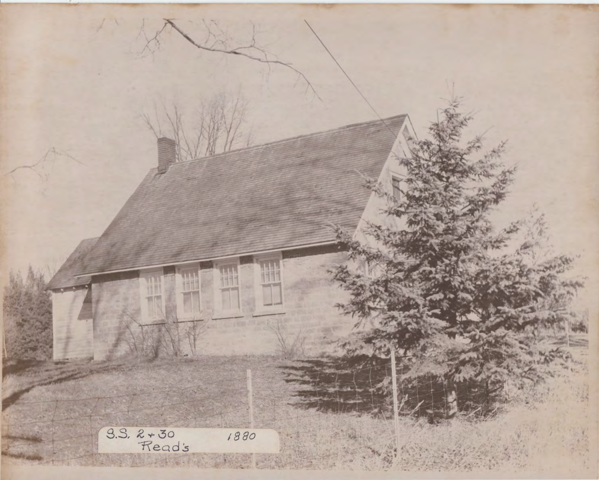
S.S. 2+30 Read's