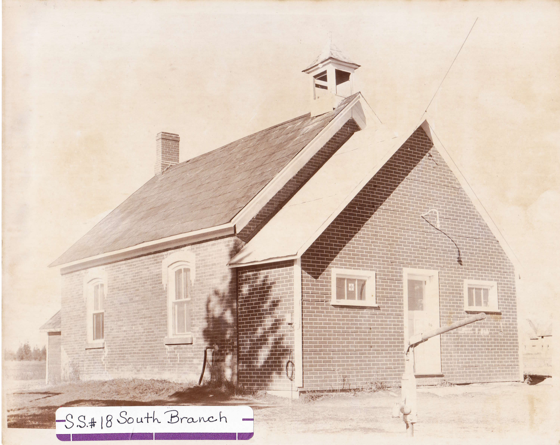
S.S.#18 South Branch