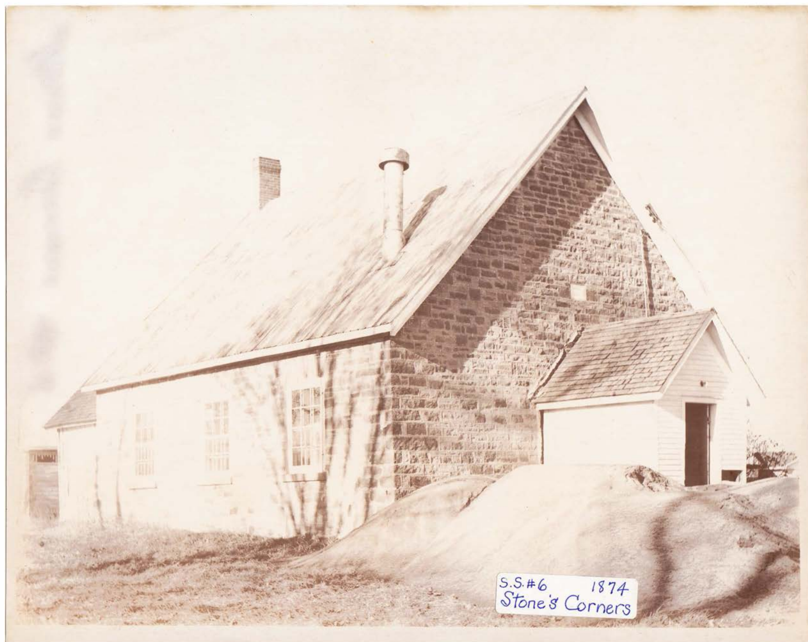
S.S.#6 1874 Stone's Corners